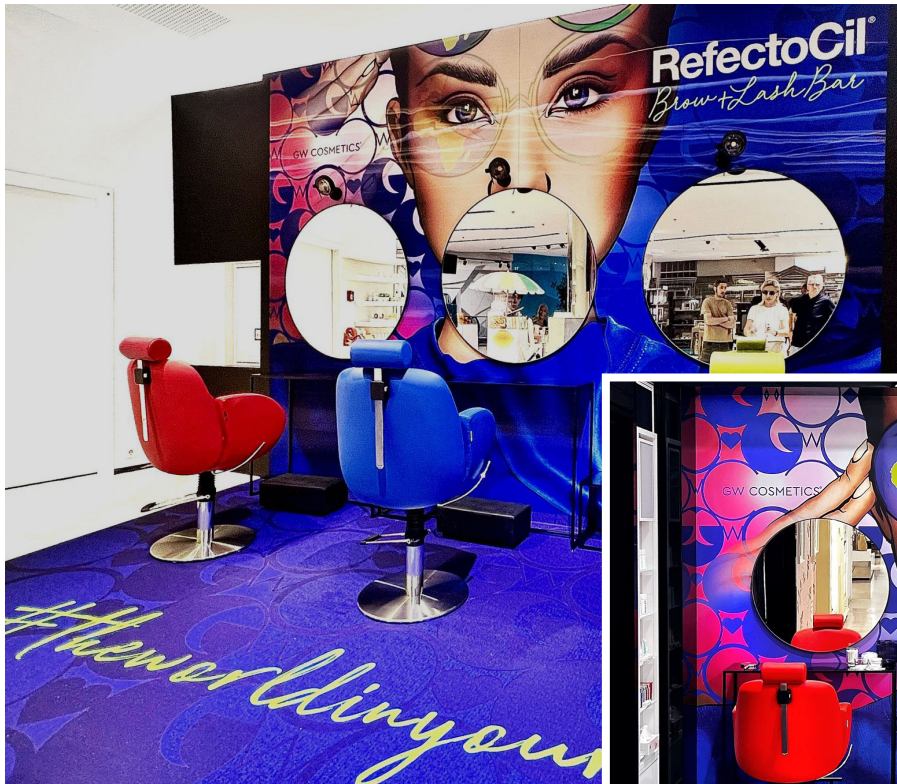
STEFFL DEPARTMENT STORE VIENNA